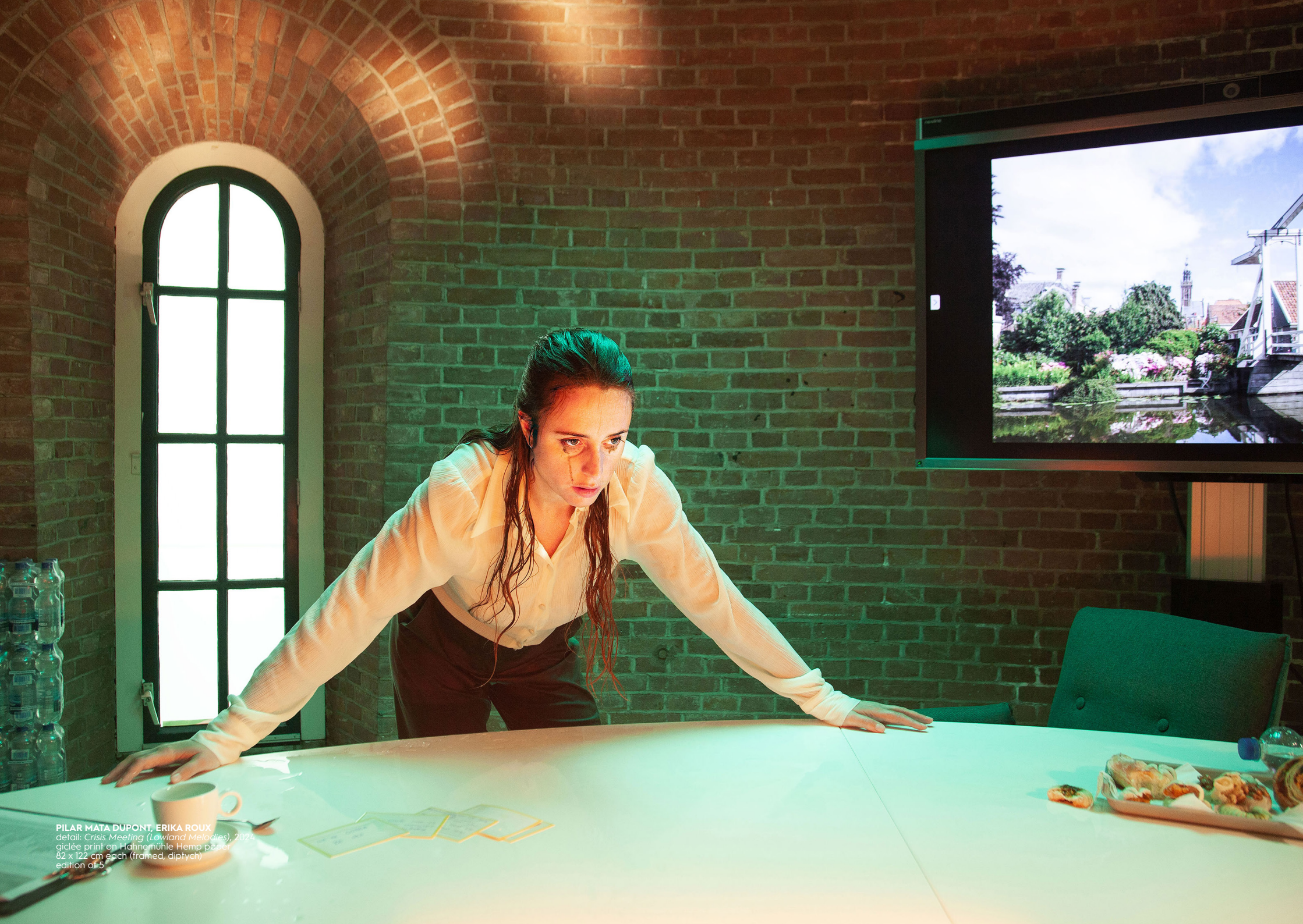
PILAR MATA DUPONT, ERIKA ROUX detail: Crisis Meeting (Lowland Melodies) , 2024 giclée print on Hahnemühle Hemp paper 82 x 122 cm each (framed, diptych) edition of 5